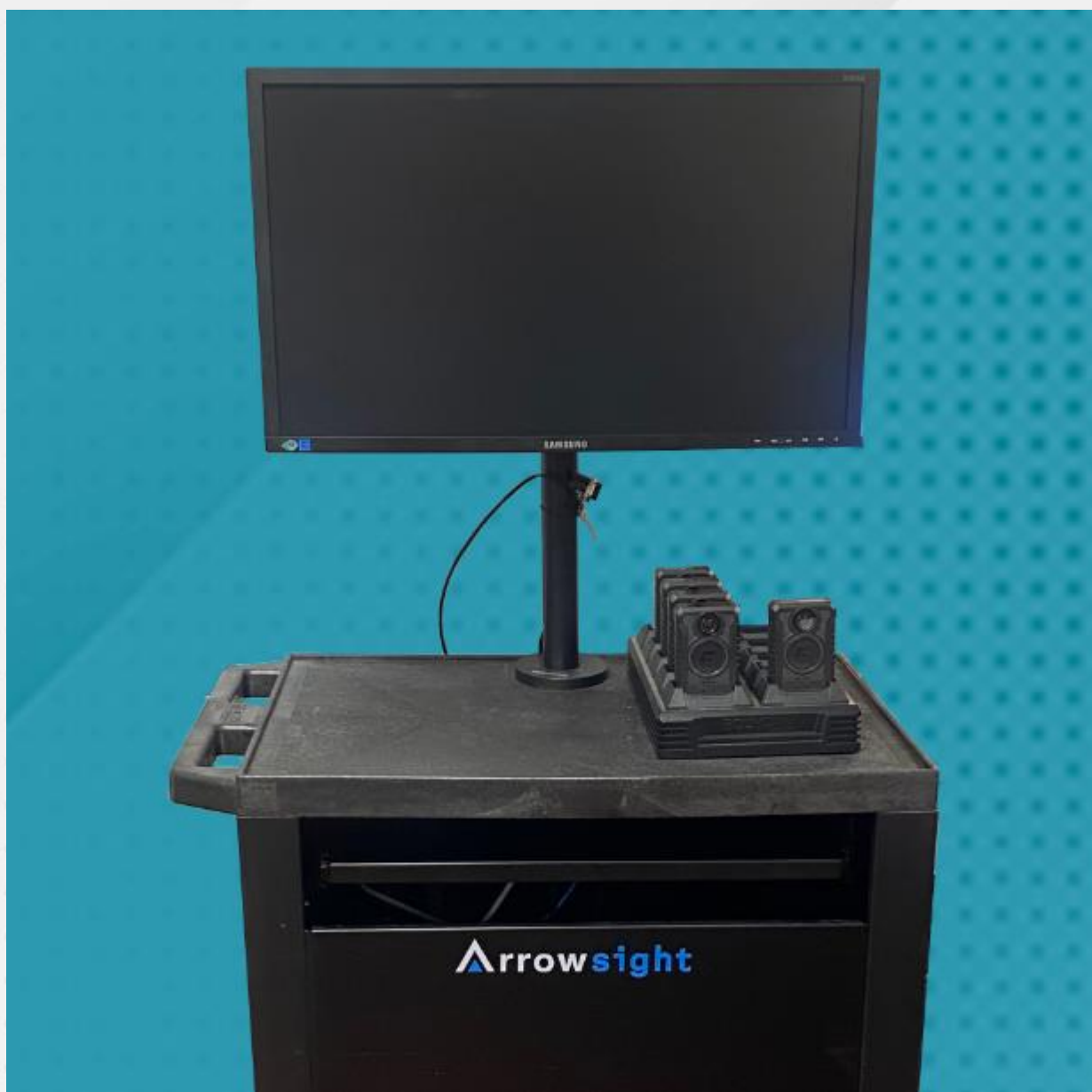
Figure #2 – Network Video Recorder (NVR) and Docking Station Cart